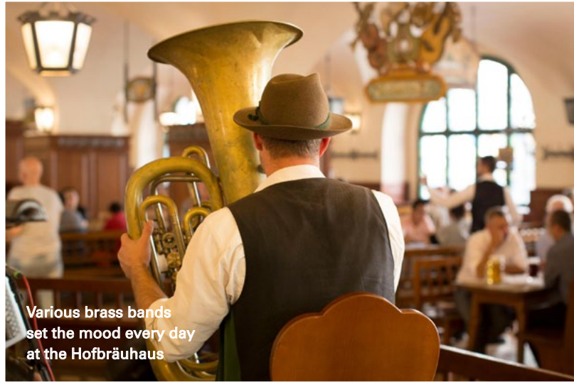
Various brass bands set the mood every day at the Hofbräuhaus