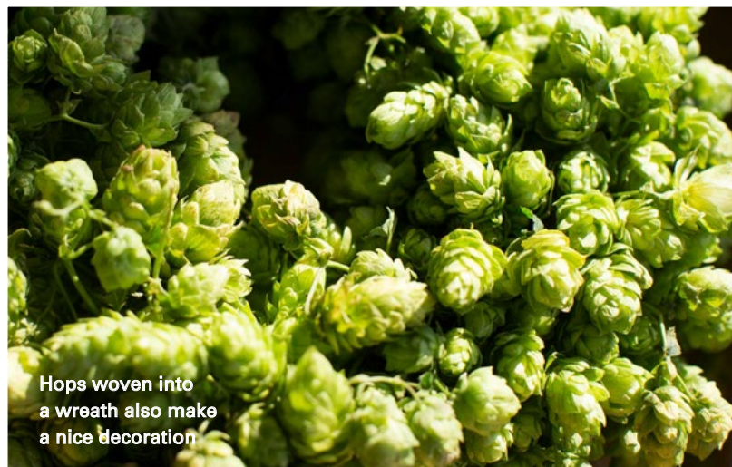
Hops woven into a wreath also make a nice decoration