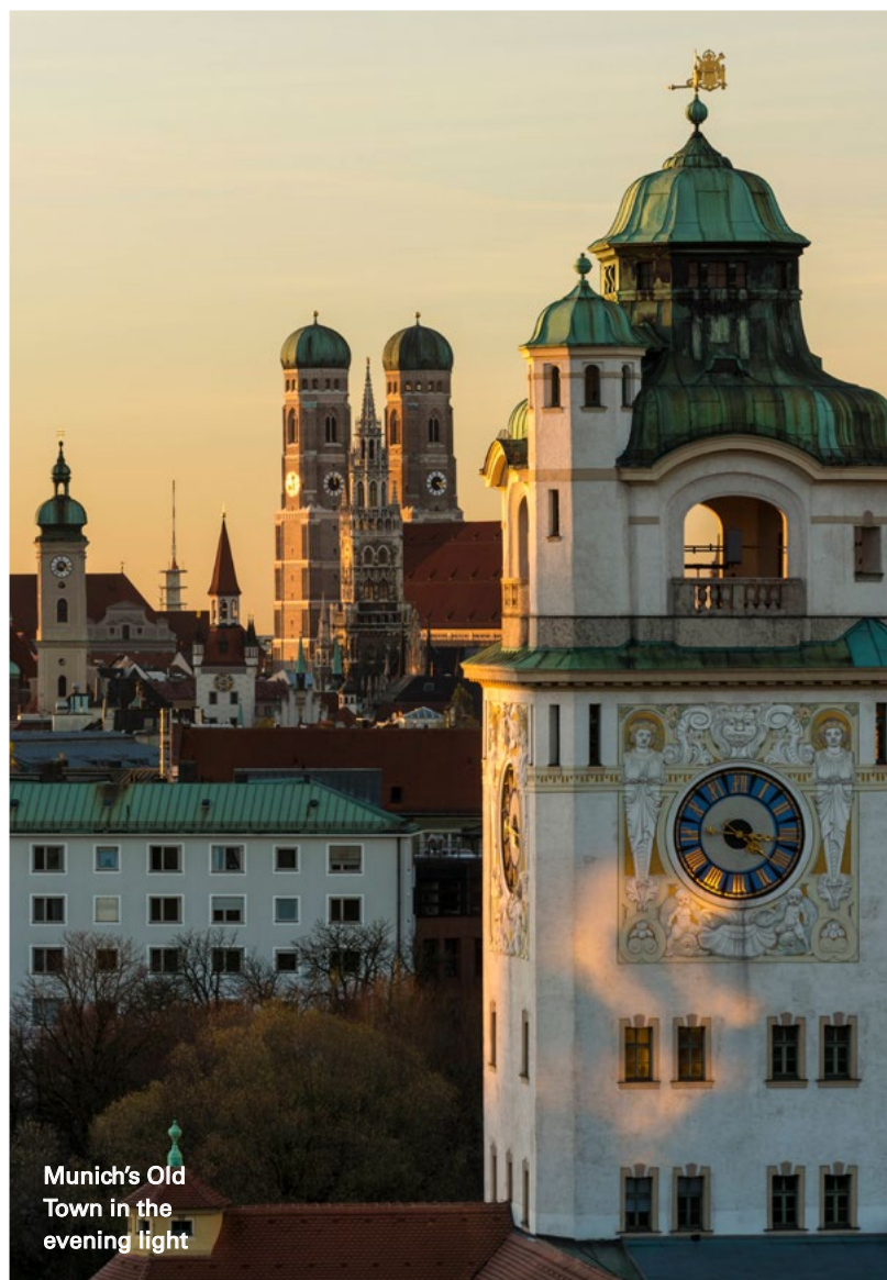
Munich's Old Town in the evening light