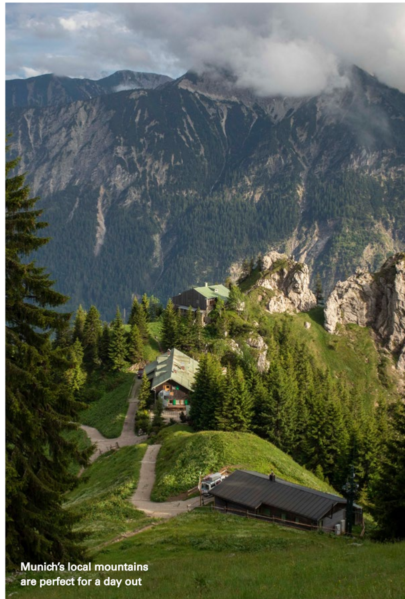
Munich's local mountains are perfect for a day out