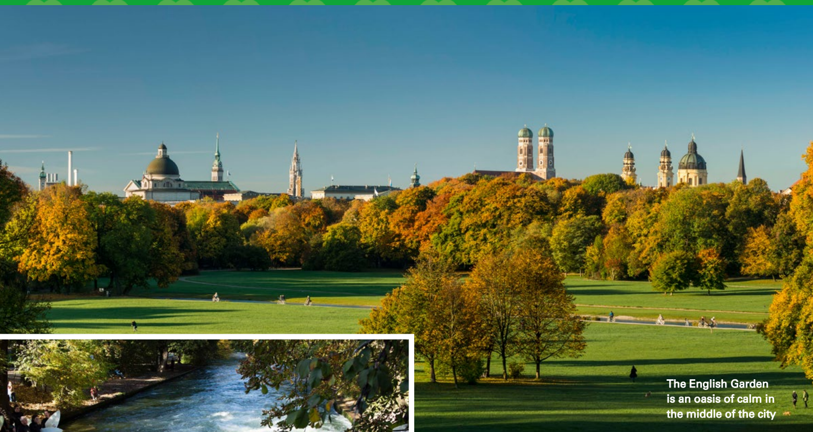
The English Garden is an oasis of calm in the middle of the city