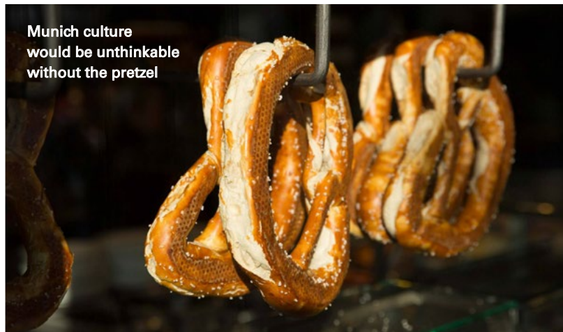
Munich culture would be unthinkable without the pretzel