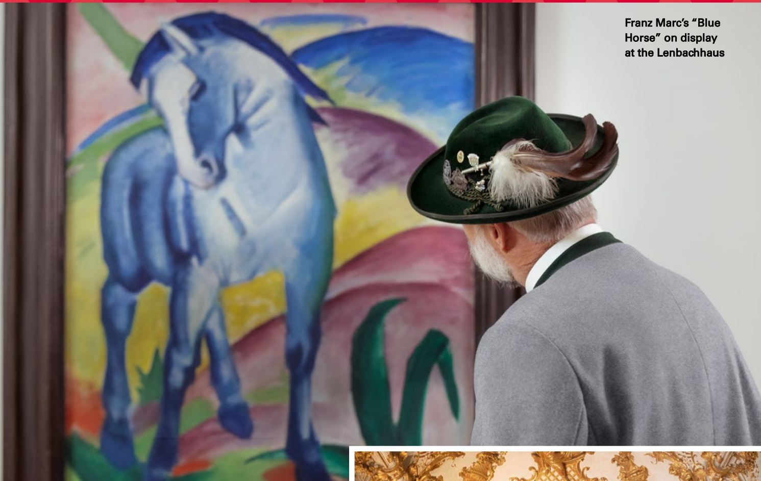
Franz Marc's "Blue Horse" on display at the Lenbachhaus