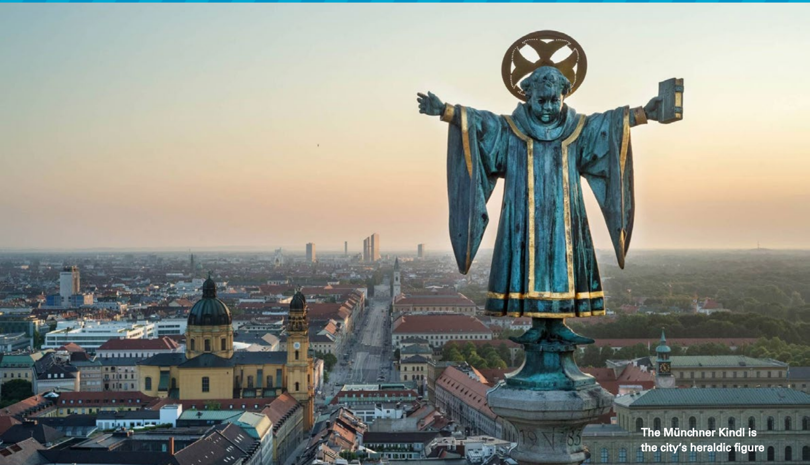
The Münchner Kindl is the city's heraldic figure